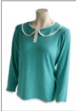
PJ Tops 5008: Tunstole Price $73.99 Sizes: 10, 12, 14, 16, 18