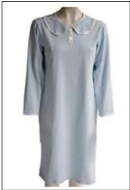
Nightie 5003: Tunstole Price $139.99 Sizes: 10, 12, 14, 16, 18