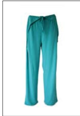
PJ Trousers 5009: Back Opening Price $63.99 Sizes: 10, 12, 14, 16, 18