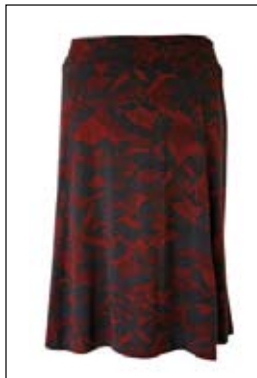
Skirt 2065: Wrap Around Price $185.99 Sizes: 10, 12, 14, 16, 18