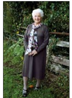
Dress 3002: Tunstole Price $229.99 Sizes: 10, 12, 14, 16, 18