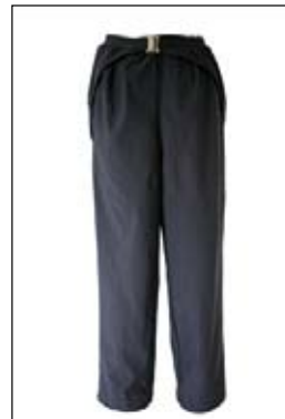
Trousers 2002: Back Opening Price $189.99 Sizes: 10, 12, 14, 16, 18