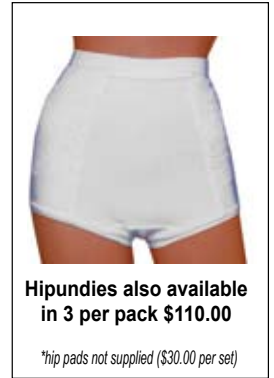
Hipundies also available in 3 per pack $110.00