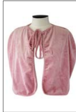
Bed Jacket 5001 Price $35.99 Sizes: One Size