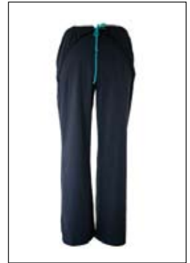
PJ Trousers 5056: Back Opening Price $64.99. Sizes: S, M, L, XL