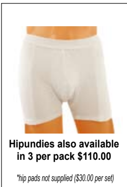
Hipundies also available in 3 per pack $110.00