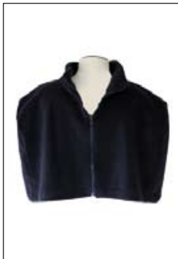
Bed Jacket 5052 Price $44.99 Sizes: One Size