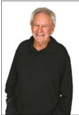
Polo Shirt 7002: Tunstole Price $94.99 Sizes: S, M, L, XL