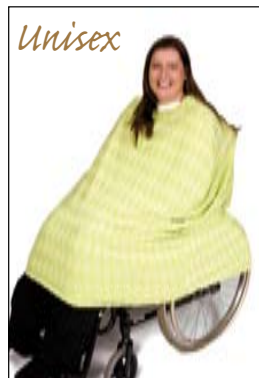
Shower Cape 1101: $49.99

“Ideal privacy for going to and from a shower”