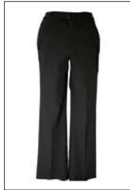
Trousers 6002: Back Opening Price $124.99 Sizes: S, M, L, XL