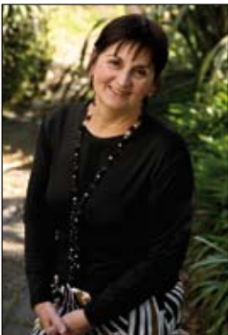
Top 1002: Tunstole Price $143.99 Sizes: 10, 12, 14, 16, 18