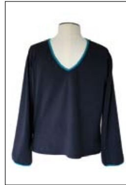
PJ Tops 5054: Tunstole Price $58.99 Sizes: S, M, L, XL